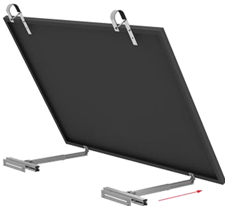
Adjustable leg to achieve tilt angle