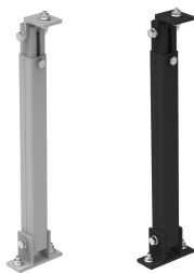
Adjustable Rear Leg: Silver or Black